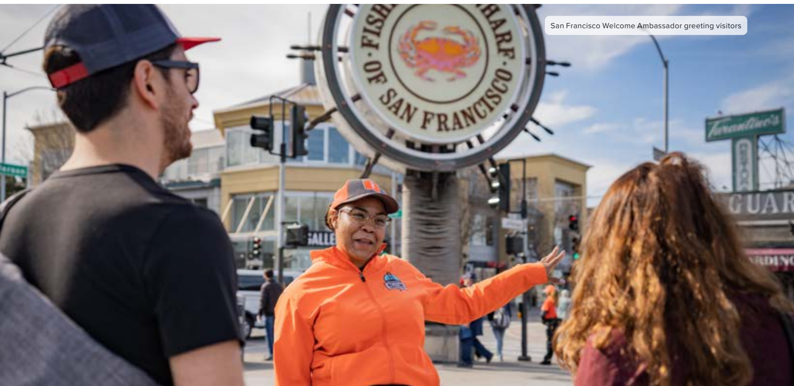
San Francisco Welcome Ambassador greeting visitors